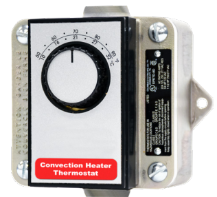
Model CHT Convection Heater Thermostat (for external or remote mounting)