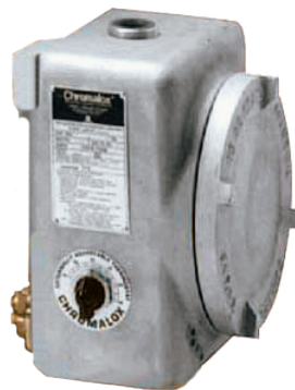
Model IHC Integrated Heater Control Unit (shown w/ internal thermostat)

Available with Integrated Heater Control Unit featuring Internal, External or Remote Thermostat!