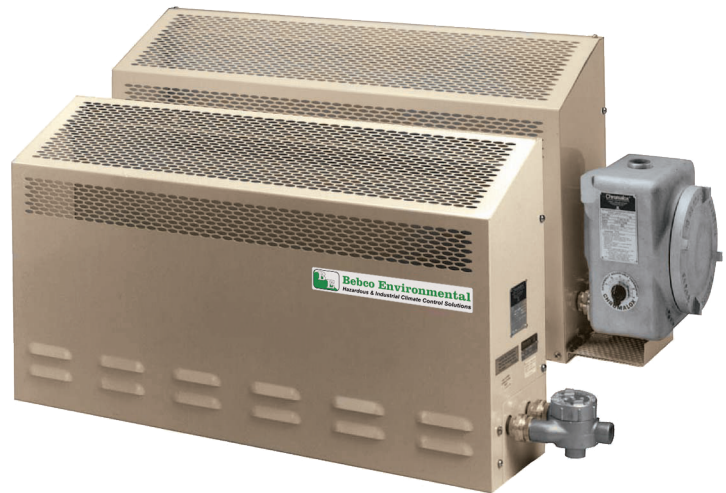
Model WMCH 12,900 BTU Wall Mount Convection Heaters (shown with and without Integrated Heater Control Unit)