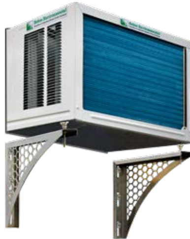
Model WMB-STU Stationary & Model WMB-PTU Portable Through Wall Unit Mounting Brackets

Rated to withstand up to 220 Pounds Over Maximum Load!