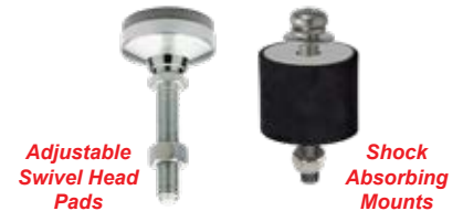
Adjustable Swivel Head Pads