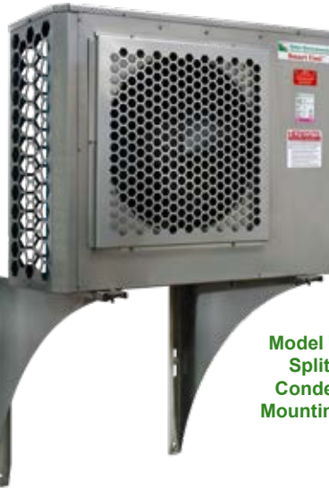
Model WMB-SCU Split System Condenser Unit Mounting Brackets