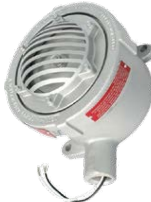
Model RAH-1-P-C ALARM HORN