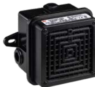
Model RAH-2-S-C ALARM HORN

See mounting and dome guard options on Page 2