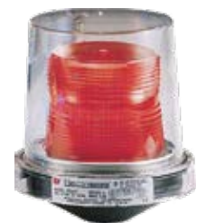
Model ERAB-2-P-C ECONOMY ALARM BEACON

Contact our factory for optional Model RAB-1 & RAB-2 dome guards and alternate Model RAB and ERAB dome colors!