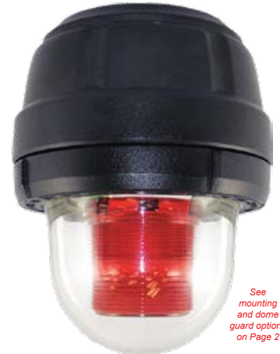
Model RAB-1-C-C ALARM BEACON

See mounting and dome guard options on Page 2