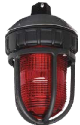
Model RAB-2-P-C ALARM BEACON